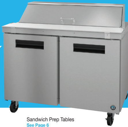
Sandwich Prep Tables See Page 6

Need to chill or freeze? We have many options to choose from.