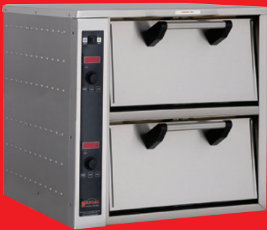
Ovens See Pages 9, 10 and 12