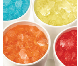
C-80BAJ - Produces cubelet style mini cubes