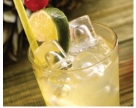
AM-50BAJ - Produces top-hat style full cubes