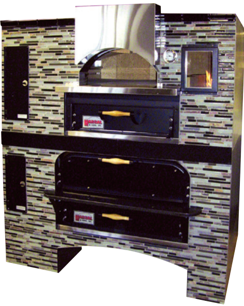
WF SERIES WAVE FLAME DECK OVEN