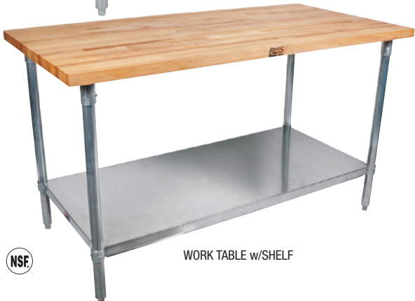
WORK TABLE w/SHELF