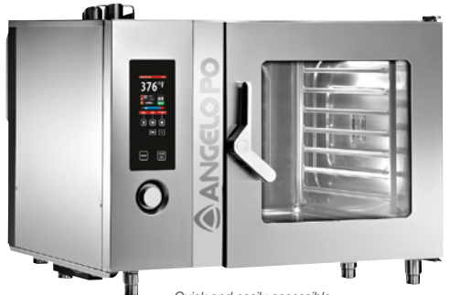
Quick and easily accessible customized menu programs