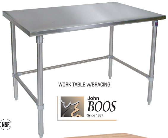
WORK TABLE w/BRACING