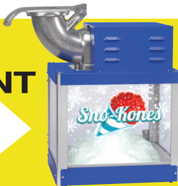
Sno Kone Machine See Page 16

Are you in the market for concession, kitchen, storage, warewashing or back bar equipment? We have it!