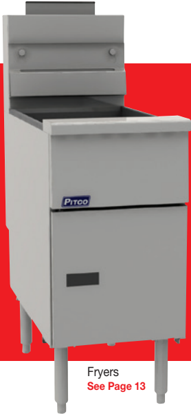
Fryers See Page 13