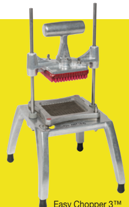
Easy Chopper 3™ See Page 18