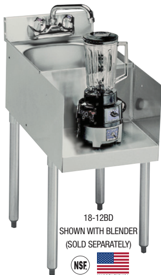
18-12BD SHOWN WITH BLENDER (SOLD SEPARATELY)