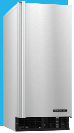
Ice Machines See Pages 7 - 8