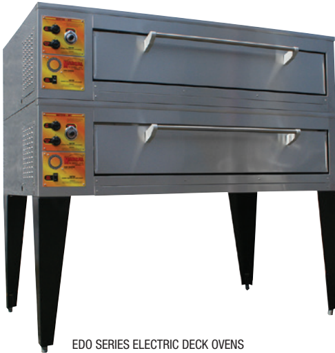
EDO SERIES ELECTRIC DECK OVENS