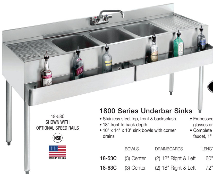
18-53C SHOWN WITH OPTIONAL SPEED RAILS