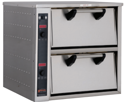
CT SERIES COUNTERTOP DECK OVEN

PLEASE CONTACT YOUR SALES REPRESENTATIVE FOR ADDITIONAL INFORMATION.