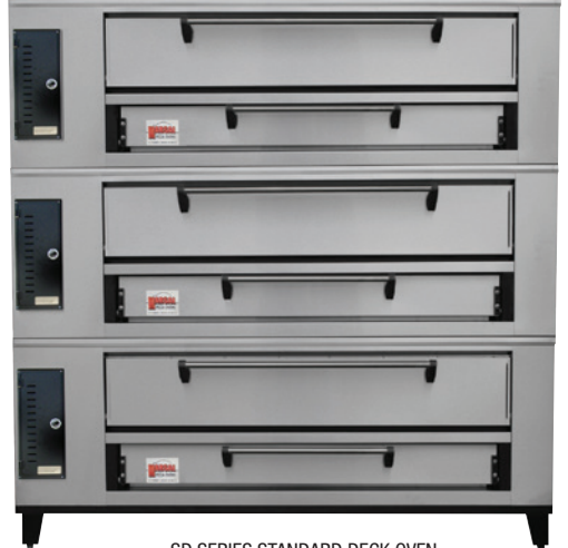
SD SERIES STANDARD DECK OVEN