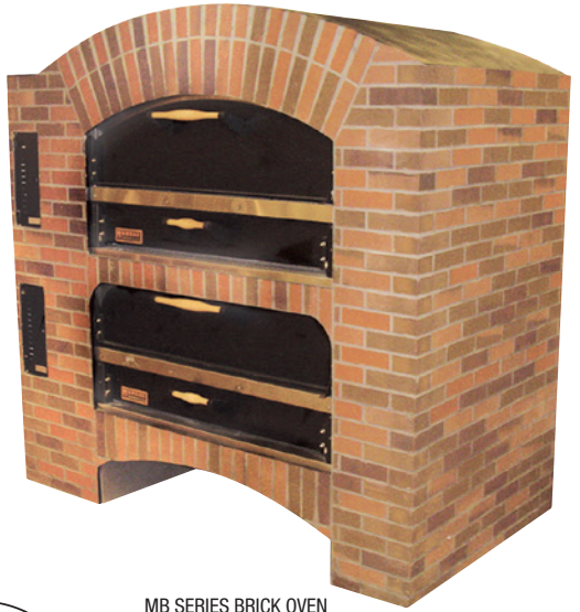
MB SERIES BRICK OVEN