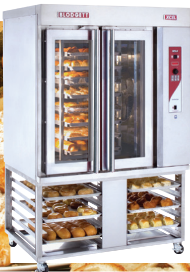
XR8-G Shown with optional stand